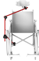
RM-3 Proceed to Step 2B