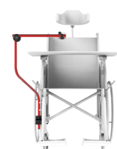
RM-S Proceed to Step 2C